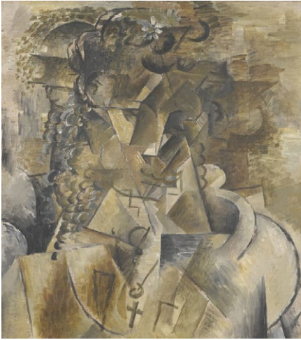
Girl with a Cross, Georges Braque, 1911

What do you think is the subject of the picture/sculpture?